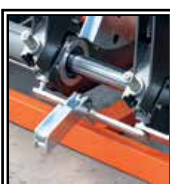
Detach device for heater