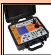
The INSPECTOR Data-logging