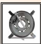
Tool for flange necks