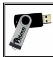
Software Ritmo Transfer