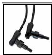
Universal connectors 90°